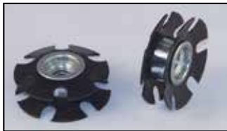
( IL25-4-TC Tube Connectors )

14A- Star Type Tube Connectors These metal, star-type threaded tube connectors are designed to fit inside square or round (16-18 gauge) tubing.