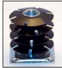
( IL27-7 & IL27A-7 )

14A- Star Type Tube Connectors These metal, star-type threaded tube connectors are designed to fit inside square or round (16-18 gauge) tubing.