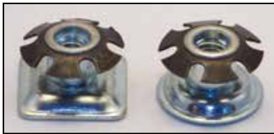
( IL24-IL27A )